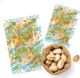
SILICA GEL DESICCANT

OPP-packed indicating silica gel desiccant utilizes premium quality silica gel raw material which has constant chemical and physical characteristics, it is non-toxic and non-hazardous. Visible change is convenient for confirming the saturation of moisture absorption to check product quality. The packaging material is porous OPP which has strong seal strength and good oil resistivity. This type of desiccant can be used in all types of seaweed, cookies, nuts, dried vegetables and fruits, spices, puffed food, and more.